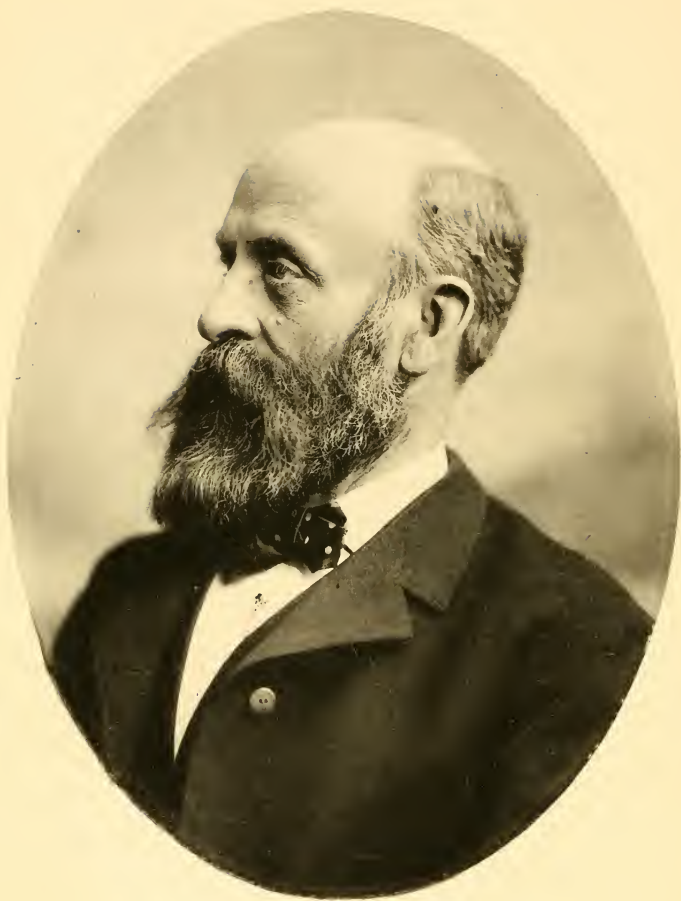
Alvan G. Clark